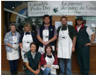
Friends of Mount Revelstoke & Glacier National Parks